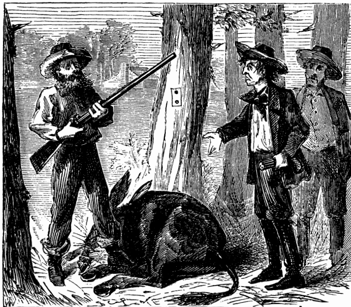
INDUCEMENTS TO PURCHASE.

ing tobacco. We had two large canteens to carry water in, between stations on the Plains, and we also took with us a little shot-bag of silver coin for daily expenses in the way of breakfasts and dinners.