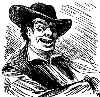
THE FACETIOUS DRIVER.

About all the rest of the coach was full of mail-bags—for we had three days' delayed mails with us. Almost touching our knees, a perpendicular wall of mail matter rose up to the roof. There was a great pile of it strapped on top of the stage, and both the fore and hind boots were full. We had twenty-seven hundred pounds of it aboard, the driver said—"a little for