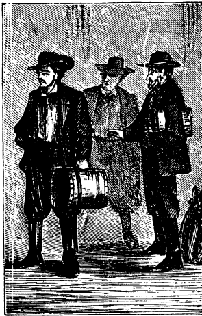
LIGHT TRAVELING ORDER.

The next morning, bright and early, we took a hasty breakfast, and hurried to the starting-place. Then an inconvenience presented itself which we had not properly appreciated before, namely, that one cannot make a heavy traveling trunk stand for twenty-five pounds of baggage—because it weighs a good deal more. But that was all we could take—twenty-five pounds each. So