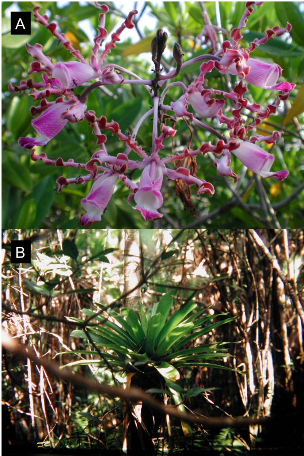
Appendix Figure 7. 3. Mangroves can support a diverse epiphytic community. In areas of high rainfall and humidity, mangroves support arboreal epiphytes such as A. orchids and B. bromeliads.