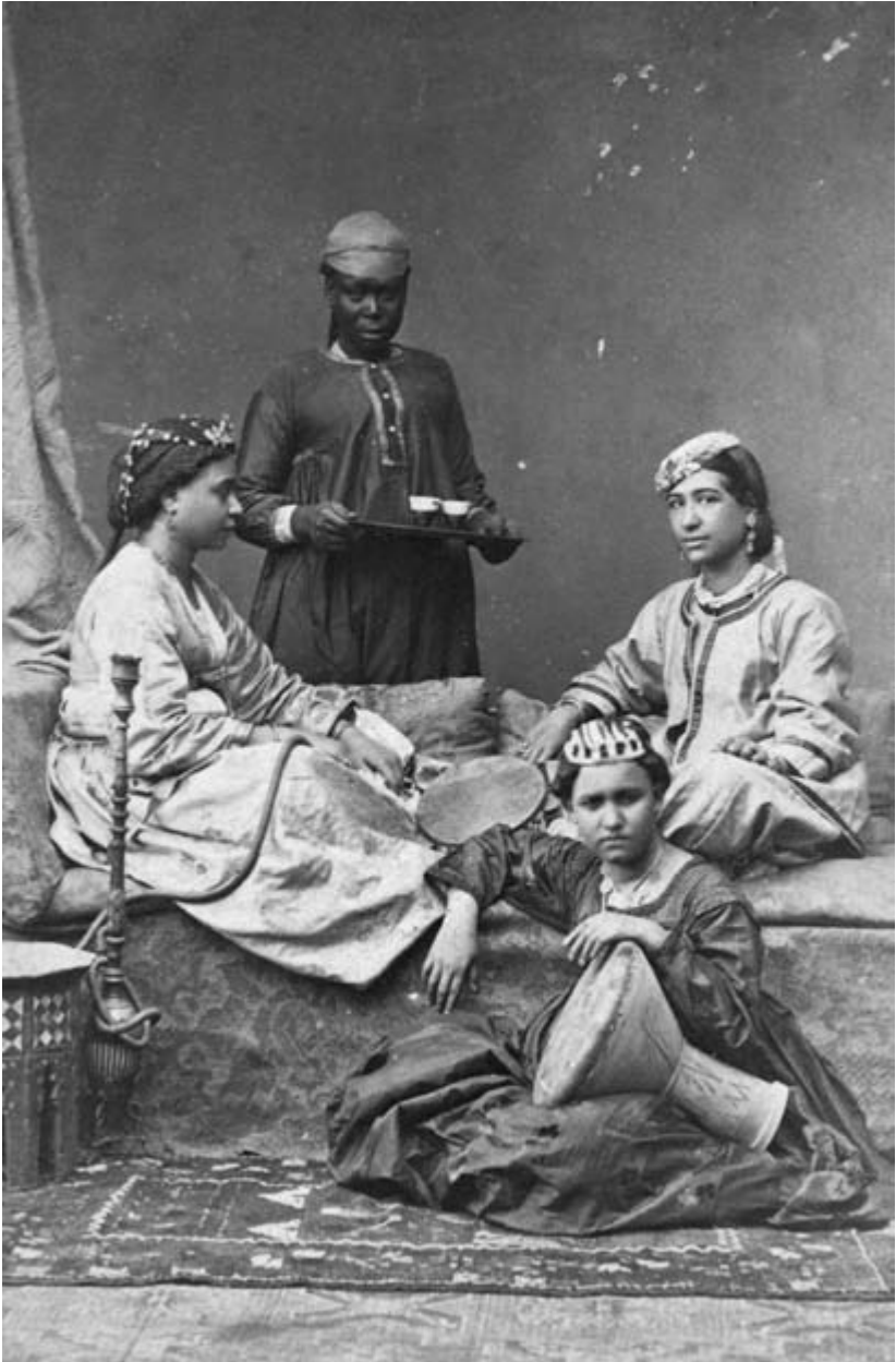
Figure 1. Turkish women in a late nineteenth-century harem.