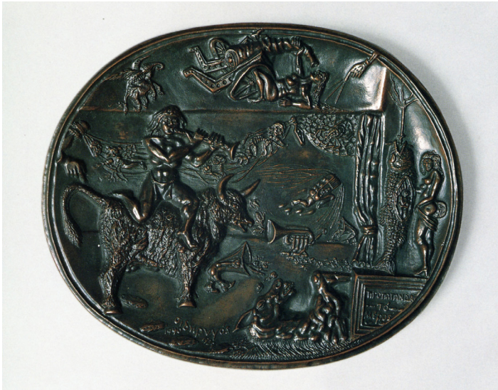
FIGURE 8 David Smith, Propaganda for War , from Medals for Dishonor , 1939–40. Cast bronze, 9\frac{5}{8} \times 11\frac{3}{4} \times \frac{7}{8} in. (24.4 \times 29.8 \times 2.2 cm). The Estate of David Smith, New York. Art © The Estate of David Smith/Licensed by VAGA, New York, NY.

as the fleeing family. As Whiting further suggested, the lack of identifying symbols or markers that might place the figures in Spain works to transform them into types. Their plight is thus elevated to a universal level, above nationality or political allegiance, to establish a subject position that virtually anyone might occupy. In reproducing Refugees on the cover of the exhibition checklist and as the final image in the exhibition brochure, Herman Baron made the painting the one most likely to remain in viewers' minds after they had left the gallery. The message was as simple as it was pressing: without immediate help, the Republic of Spain would be in trouble. After it fell, which country would be next? When linked with other works in the exhibition and the art that followed it, Refugees conjures up a world dangerously in flux, where the family is at risk, parents are missing or unable to protect their children, houses are bombed into ruins, women are imprisoned, and sons are forced by circumstance to replace fathers as protectors of hearth and home.