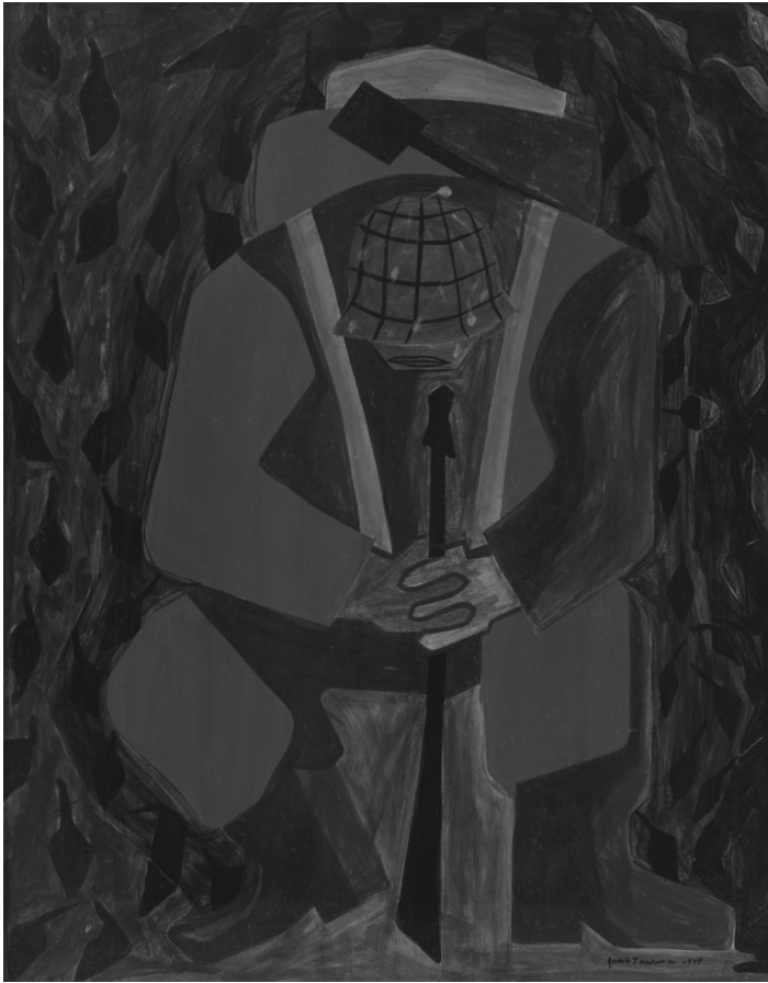
FIGURE 13 Jacob Lawrence, War Series: Victory , 1946–47. Egg tempera on composition board, 20 × 16 in. (50.8 × 40.64 cm). Whitney Museum of American Art, New York; gift of Mr. and Mrs. Roy R. Neuberger 51.19. Digital Image, © Whitney Museum of American Art, NY. ©2015 The Jacob and Gwendolyn Lawrence Foundation, Seattle/Artists Rights Society (ARS), New York.

War begins and ends with moments of reflection while oscillating between the group and the individual, the front and home. In the first panel, Prayer , a man and woman kneel with heads bowed. Given their indeterminate age, they might be parents asking protection for a son in uniform, or they may be preparing for their own separation as he leaves for duty. Either way, their solemnity sets the stage for the elegiac mood suffusing all fourteen panels. Several scenes packed with soldiers and sailors follow, the cramped spaces of these images providing a fitting visual analogue to the massive numbers of Americans shipped overseas. Shipping Out , Alert , On Leave , Beachhead , and Reported Missing flesh out the narrative of departure, socializing, combat, and imprisonment that was part of the war's story. Most of the soldiers are clearly of African descent, although the variety of shading makes it difficult to read all of the men as being of one, monolithic group. The effect recognized the difference of ethnicity within Black communities and communicated Lawrence's progressive politics, which anticipated a racially liberated world in which men of European and African descent would serve together in integrated units.